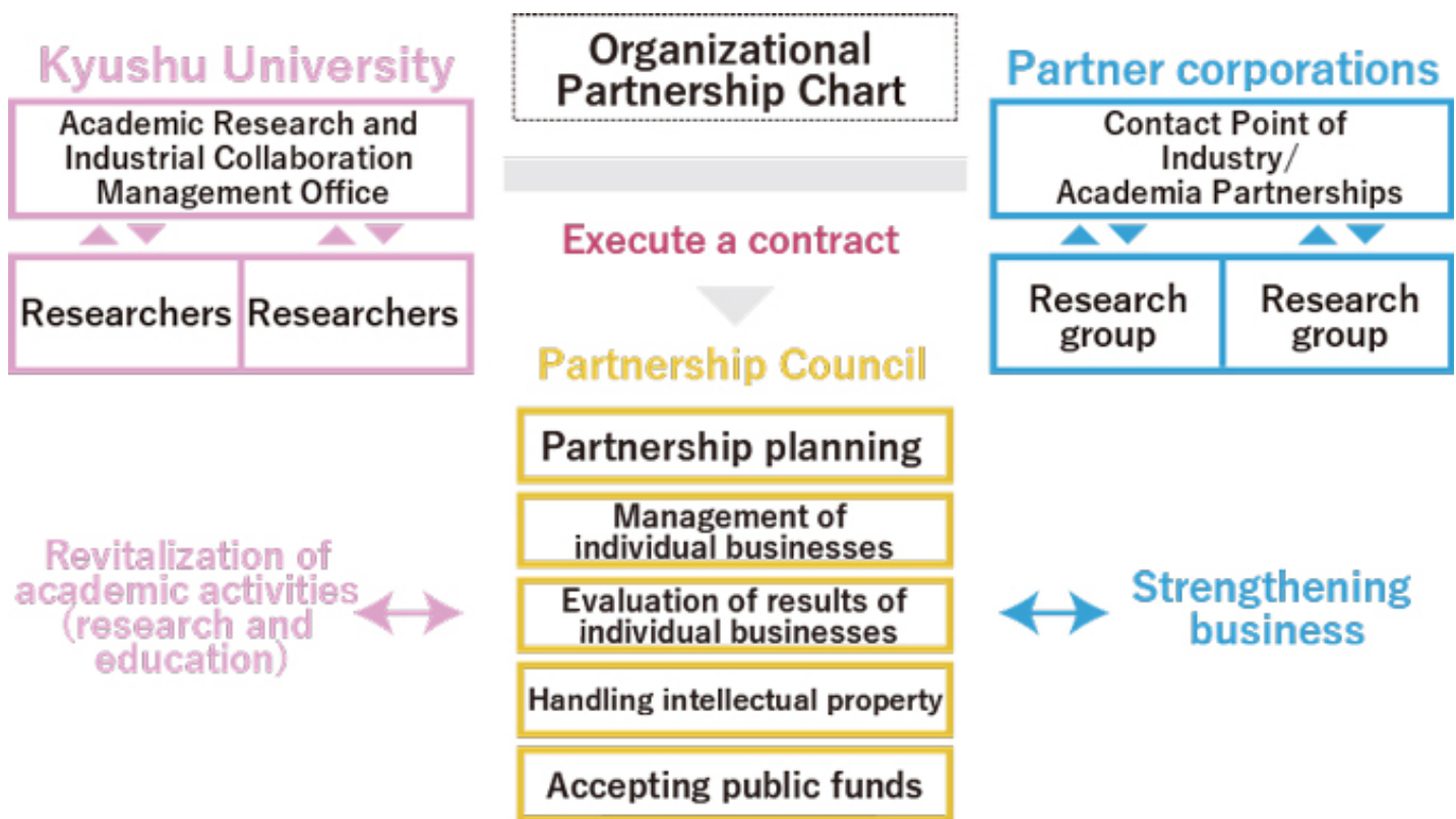
【Chart 4】 About the Joint Research Department